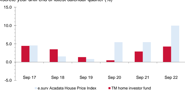
Discrete total return (%) 12 months ending:

Discrete year until end of latest calendar quarter (%)